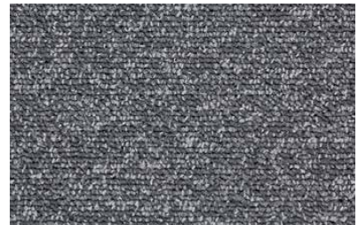
940 Cast Iron