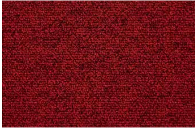
570 Chilli Powder