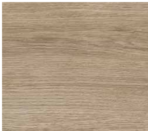
1425 Ridge Oak