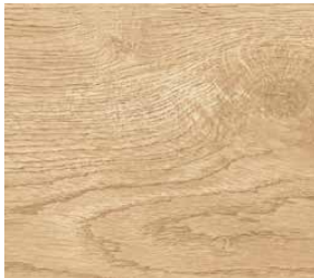
1427 Bourbon Yellow