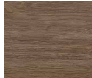
1424 English Mahogany