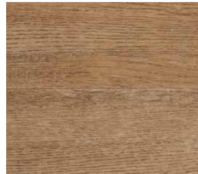
1415 Smoked Oak