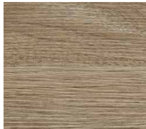
1263 Natural Oak