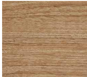
1253 Blonde Walnut