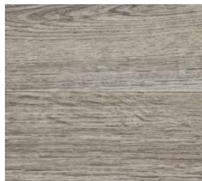
1300 Silver Birch