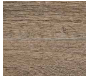
1301 Craft Oak