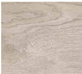
1426 Coade Beige