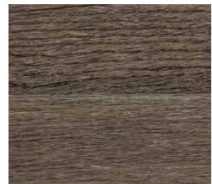
1410 Sawn Grey