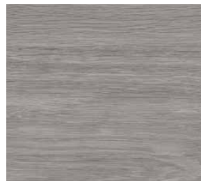
1423 Dali Grey